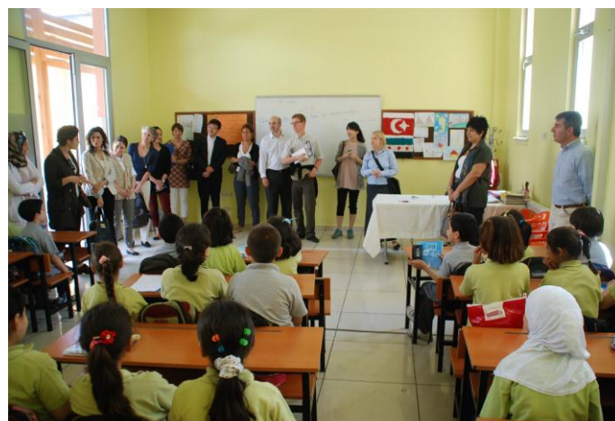
RRP Donor representatives visiting a Gaziantep Municipality school for Syrian children

Other RRP donor country representatives have visited Jordan and Lebanon.