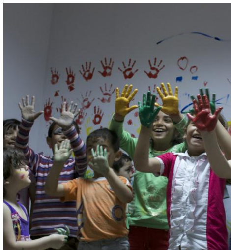
Refugee children hand-painting the wall of the IMC Multi-Service Center in Gaziantep at the occasion of World Refugee Day.