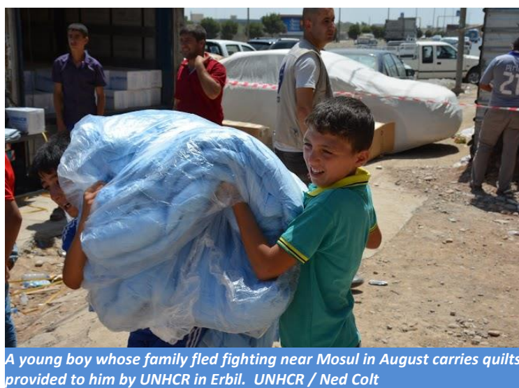
A young boy whose family fled fighting near Mosul in August carries quilts provided to him by UNHCR in Erbil.