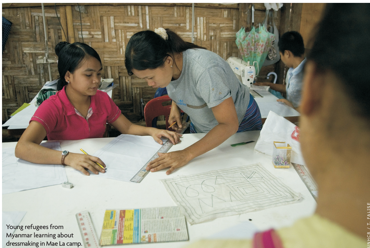
Young refugees from Myanmar learning about dressmaking in Mae La camp.