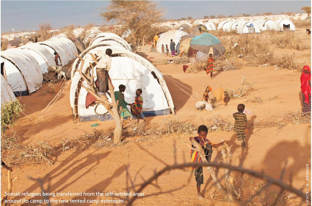
Somali refugees being transferred from the self-settled areas around Ifo camp to the new tented camp extension.