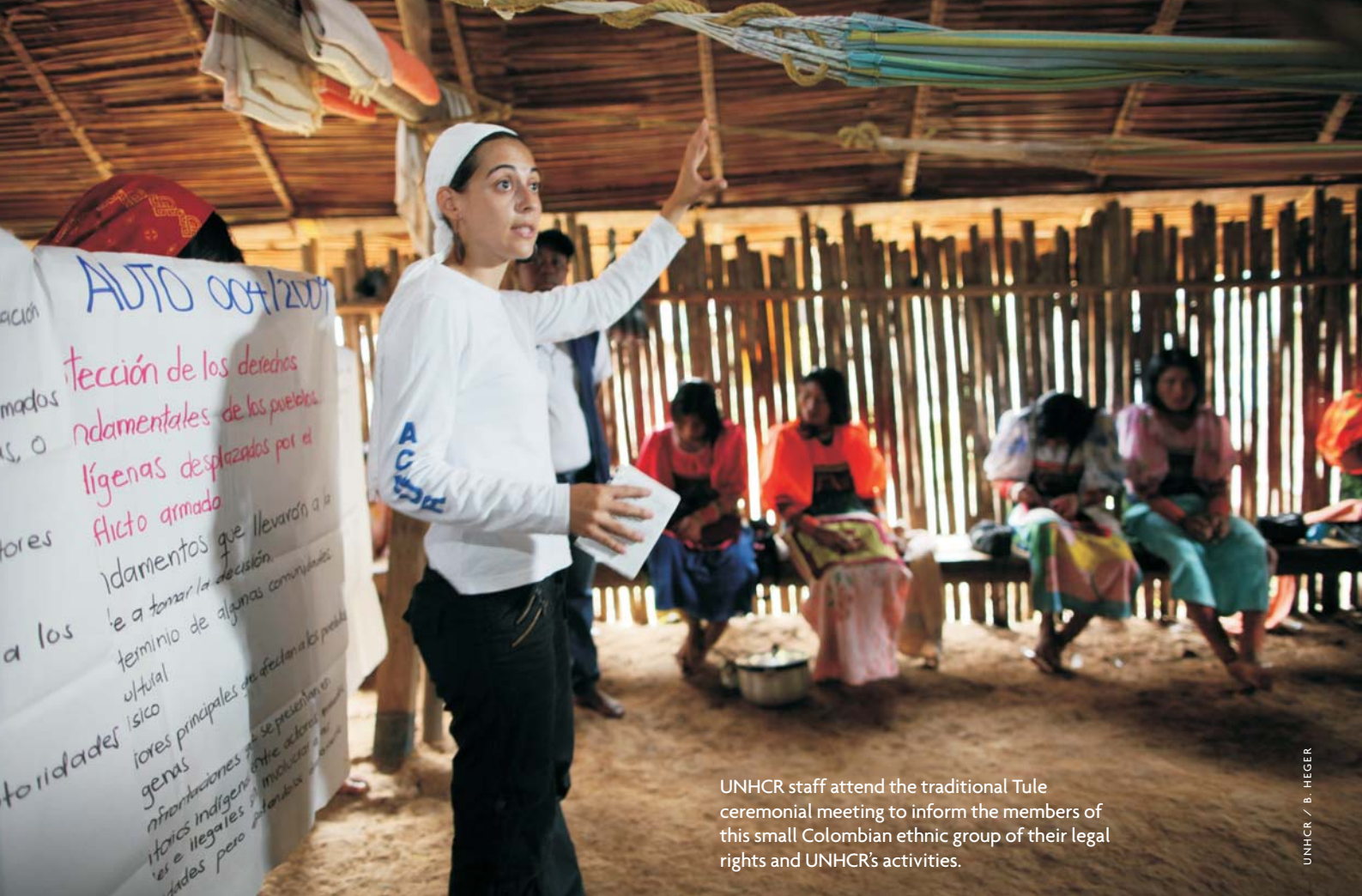
UNHCR staff attend the traditional Tule ceremonial meeting to inform the members of this small Colombian ethnic group of their legal rights and UNHCR's activities.