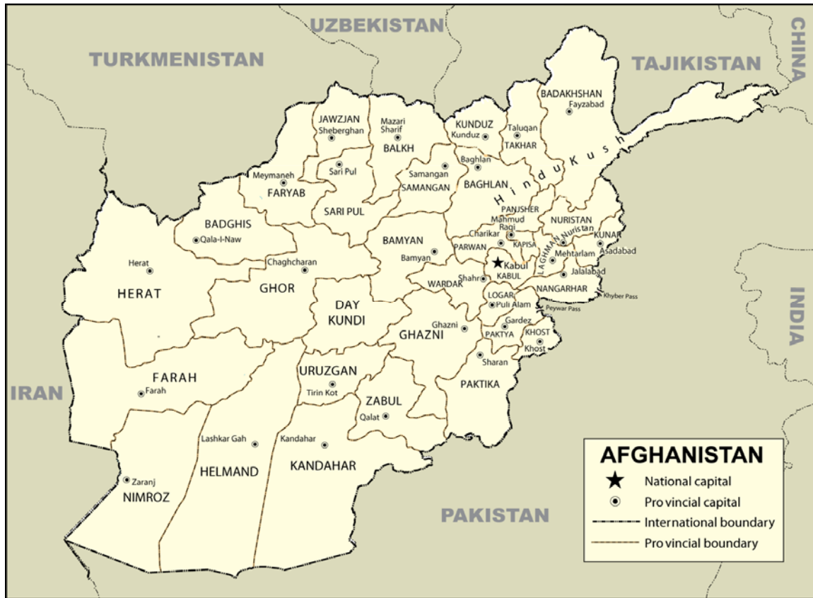
Figure A-1. Map of Afghanistan