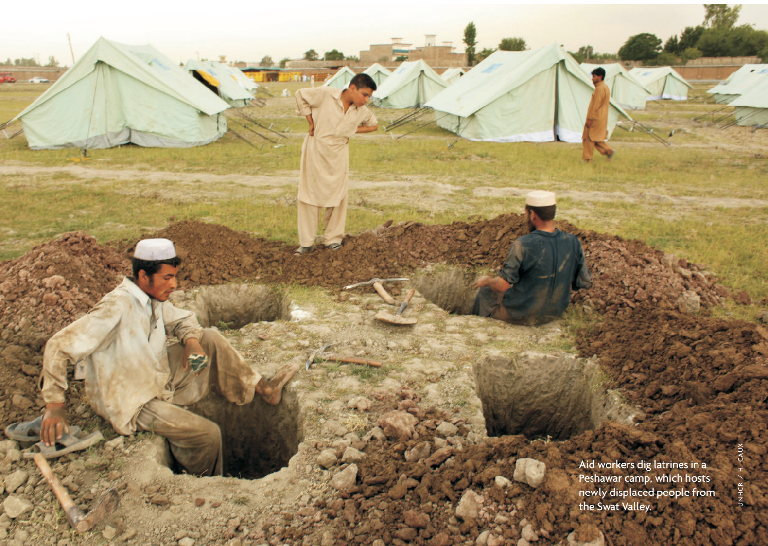
Aid workers dig latrines in a Peshawar camp, which hosts newly displaced people from the Swat Valley.

Under the supplementary programme, UNHCR supported the Government with registration activities, provide shelter materials and NFIs to displaced populations, establish camps and assist in camp management where necessary, support host communities and protect the most vulnerable populations. A final priority was to ensure the security of all staff.