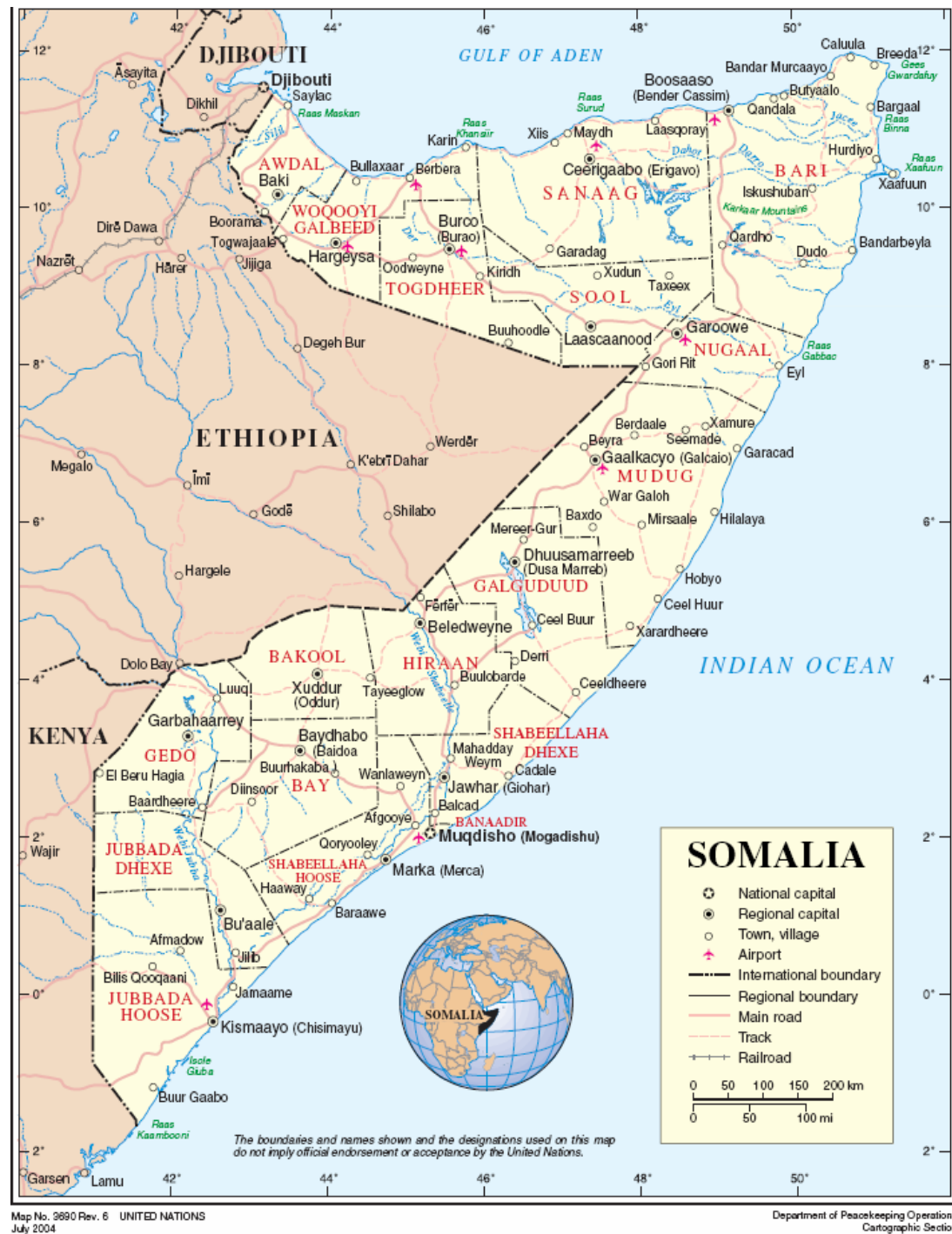
1.06 Map of Somalia, courtesy of the UN, June 2004.