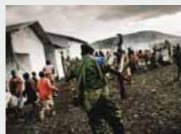
Kibati camp for displaced people, DRC.

People displaced in conflict (and on return home) often find themselves in contact with people carrying weapons in various guises. Equally, people carrying weapons are themselves generally mobile, whatever their relation to a conflict or its aftermath. In particular, members of security forces in situations of forced displacement can be agents of positive change in relation to HIV and AIDS – or part of the problem.