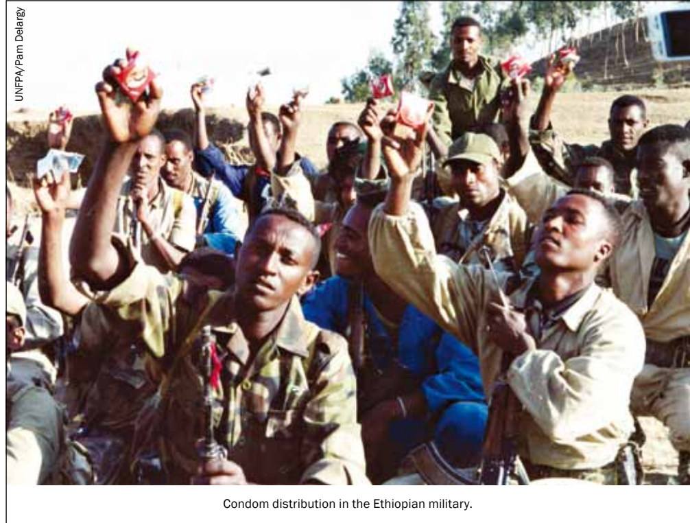
Condom distribution in the Ethiopian military.

prevention, treatment and care in regions most affected by conflict and HIV, particularly in sub-Saharan Africa